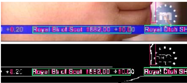
Automatic ticker position detection

Either the expected position of the ticker is preset to the module or a text detection algorithm (e.g., Real-time Video Text Detection and Recognition ) determines automatically the ticker position within the video.